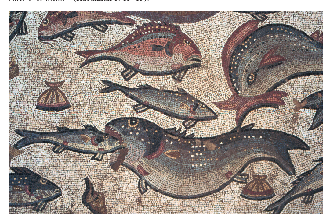
Figure 4 Big fish threatening a smaller fish (Photo Nicky Davidov, Courtesy Israel Antiquities Authority).