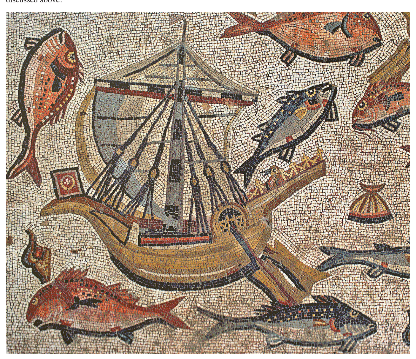
Figure 5 A vessel sailing at full speed, with windswollen sails.

world-pond is marked by human works – two ships of the type navis oneraria , the most common carrier ship of the Mediterranean Roman fleet (Casson 1971: 157–200; figs. 154, 156; Ericson 1984; Friedman 2004). One is advancing, sailing with full sails, "running free" before the wind (Fig. 5). The other, facing the opposite direction, stands becalmed (Fig. 6). It is 'at sea', which the dictionary defines as: "to be confused, to be lost and bewildered." The artist stressed that helplessness and the ship's frustrating situation by lowering the mast, yards, sails and tackle (Hadad - Avissar 2003; Rosen 2004)<sup>2</sup>. In stark contrast, these are proudly presented on the freely sailing ship, speeding away from its stranded mate. In view of the previously discussed "big fish eat little fish" scene, significantly, the helplessness of the becalmed ship is stressed by the threatening big fish poised opposite it with open mouth armed by sharp teeth, which was discussed above.