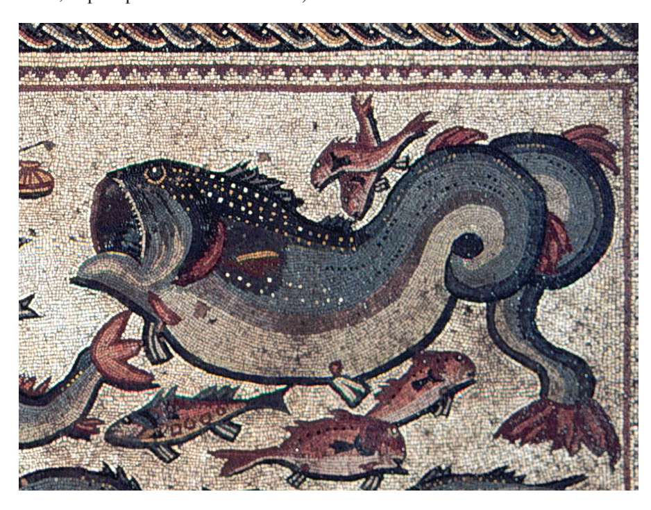
Figure 2 A marine monster (Leviathan?) with coiled tail.

Here, the nautical scene, ships and sea life, could have conveyed, besides an attachment to the sea and aesthetic pleasure, a subtext describing the power of the Judeo-Christian God: "How many are your works, O Lord! In wisdom you made them all your creatures. There is the sea, vast and spacious, teeming with creatures beyond number – living things both large and small. There the ships go to and fro, and the leviathan, which you formed to frolic there" (Psalm 104: 23–26). Key elements of that paragraph are present in the pond: "the sea"; "teaming with creatures"; "both large and small"; "ships go to and fro"; and the "leviathan" whale (?). One of the "fish" in the mosaic is defined by its unnaturally coiled tail as a symbolic whale (Fig. 2), perhaps at the time related to the leviathan of the Psalm 104 and to various depictions of sea monsters. That sea creature (Ketos, Cetus) with its coiling tail appears commonly in Jonah scenes on mosaics and wall paintings from Late Antiquity/early Christianity (Lawrence 1962; Papadopoulos - Ruscillo 2002).