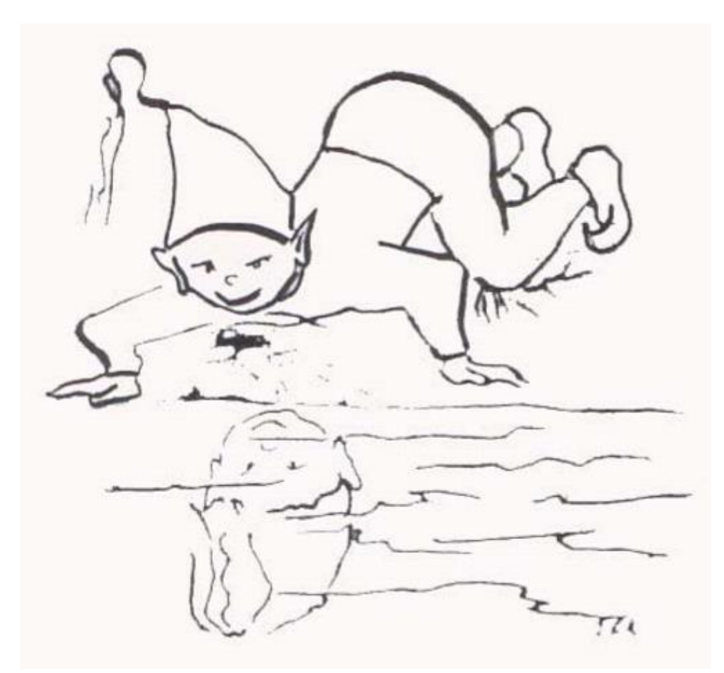
The image is adopted from a doctorate thesis by Uysal (2009).