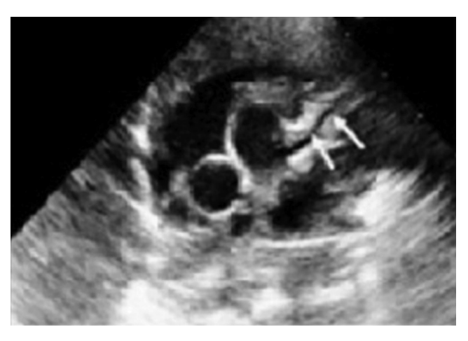
Figure 4. Echocardiographic image in the parasternal short-axis view showing the aorta and the left coronary artery (marked with arrows) arising from the pulmonary artery

This condition poses no threats during the fetal period as the pressure and oxygen saturation in the aorta and PA are equal (5). While patients are generally asymptomatic at birth, PA pressure eventually falls, the flow from PA to coronary artery gradually decreases, LV myocardial perfusion is disrupted, leading to progressive ischemia and LV dilation. As a compensatory mechanism, RCA dilates and collateral vessels are formed between RCA and