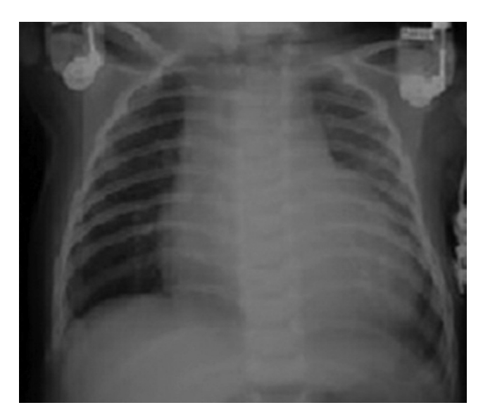
Figure 1. Cardiomegaly as seen on teleradiogram

A 2.5-month-old female patient, who had no previous symptoms, presented with distress, constant crying, feeding problems, tachypnea and sweating for 3-4 days. Teleradiography performed at a different center showed cardiomegaly, echocardiographic evaluation showed DCM. Following inconclusive metabolic and genetic tests, the patient was referred to us for further examination. Her prenatal history was unremarkable. The patient was born on term to a 22-year-old mother, her birth weight was 3000 g. There was no parental consanguinity. Weight and height percentiles were normal for the patient's age. During physical examination, the patient's general condition was fair, she appeared to be in distress and had a body temperature of 36.8 °C, heartrate of 170 bpm, blood pressure of 80/50 mmHg, oxygen saturation of 96% in room air and respiratory rate of 62/min. Heart sounds were rhythmic and there were no murmurs. Her respiratory system was normal, her liver was palpated under the costal margin as sized at 2-3 cm. Teleradiography showed a cardiothoracic ratio of 0.65 (Figure 1). Electrocardiogaphy (ECG) showed a 176 bmp sinus tachycardia, deep Q waves and inverted T waves in leads D1, aVL and V4-6 as well as left ventricular (LV) hypertrophy findings (Figure 2). Laboratory tests results were as follows; hemoglobin: 11.6 g/dL, white blood cells: 6200/mm<sup>3</sup>, thrombocytes: 318000/mm<sup>3</sup>, normal renal and liver function, electrolytes and acute phase reactants, elevated