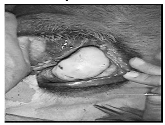
Figure 1. The tumour (T), located in the leftmandible (arrow), was very firm and immobile

compact, while others were trabecular (Figure 2). The trabecular bones were seen peripherally, while the compact bones were centrally located. The compact and trabecular bones were formed by mineralized woven bone, with a basophilic matrix composed of randomly organized fibers, and bordered by a layer of connective tissue resembling the osteoblasts (Figure 3). The compact bones had no Havarsian canals and bone marrow, while the trabecular bones had. The appearance of stroma was uniform throughout the sample and there was vascularized light connective tissue, including collagen fibers and fibroblasts between the trabecular and compact bone. No mitotic figures were observed.