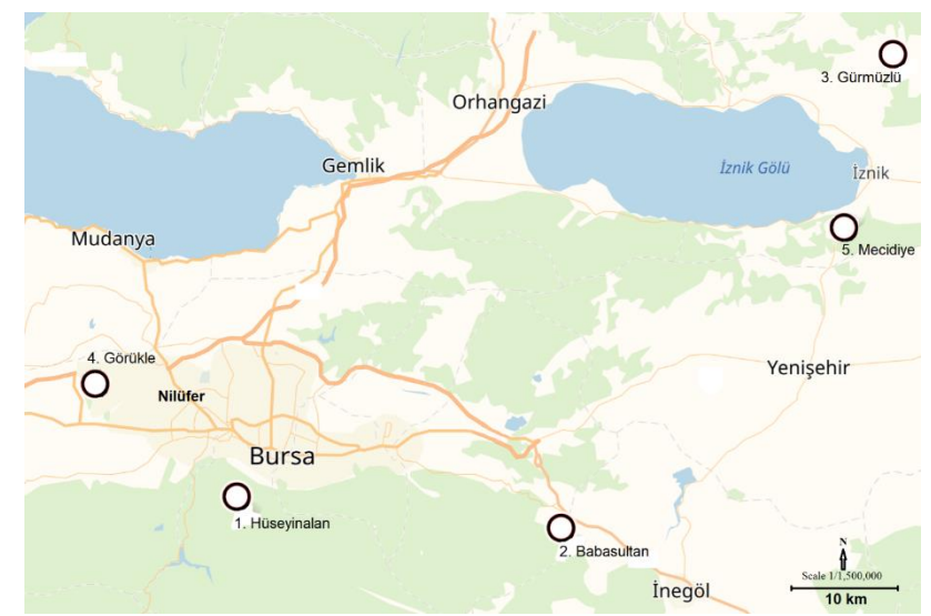
Figure 1. Map of study area. Among the sampling localities, Görükle and Mecidiye are urban, Hüseyinalan and Babasultan are semi-rural and Gürmüzlü is rural.