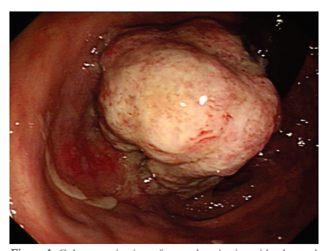
Figure 1. Colonoscopic view of cap polyps in sigmoid colon and around the anus shows a large mass with coarse surface and copious exudates before.

After resection, the main symptoms improved dramatically. A year later, colonoscopy demonstrated