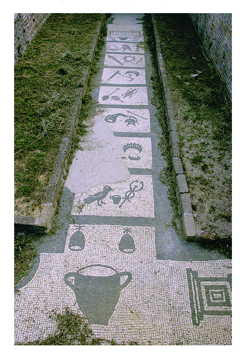
Mithraeum of Felicissimus.

Mithraeum of Felicissimus, mid 3rd century AD (Becatti 1954: 105-112; Becatti 1961: 227-230 n. 428; Floriani Squarciapino 1962: 52-54). This is the best example of the link between worship and decoration (Fig. 2). It is the most