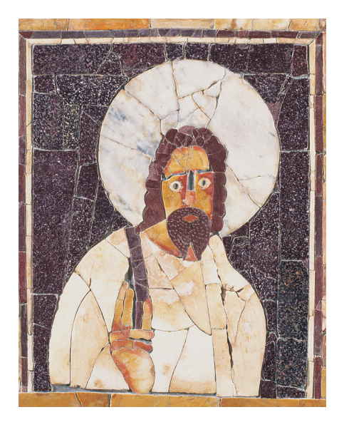
Figure 15 Domus of the opus sectile outside Porta Marina (Pellegrino 2017: 99).

The bearded figure of the opus sectile in the domus outside the Marine Gate, often interpreted as a Christ seen as a philosopher and teacher, according to the canons of Christian iconography at the end of the 4th century (Fig. 15), can also be seen, with equally convincing arguments, as a philosopher to be framed in the context of the neoplatonic culture of the time: the master represented in a frontal pose addressing one of his disciples (Brenk 2001: 266-268; Mazzucato 2021: 582).