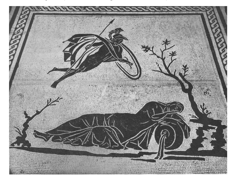
Figure 11 Rhea Silvia and Mars (Pellegrino 2017: 54).

the Hadrian's Age (Fig. 11). The artist has succeeded in effectively translating a pictorial prototype, known from other monuments, into a black and white scene using only a few white lines that manage to create with great simplicity even perspective effects in the rendering of the shield, the cloak and the water coming out of the amphora (Licordari - Pellegrino 2022: 286-287).