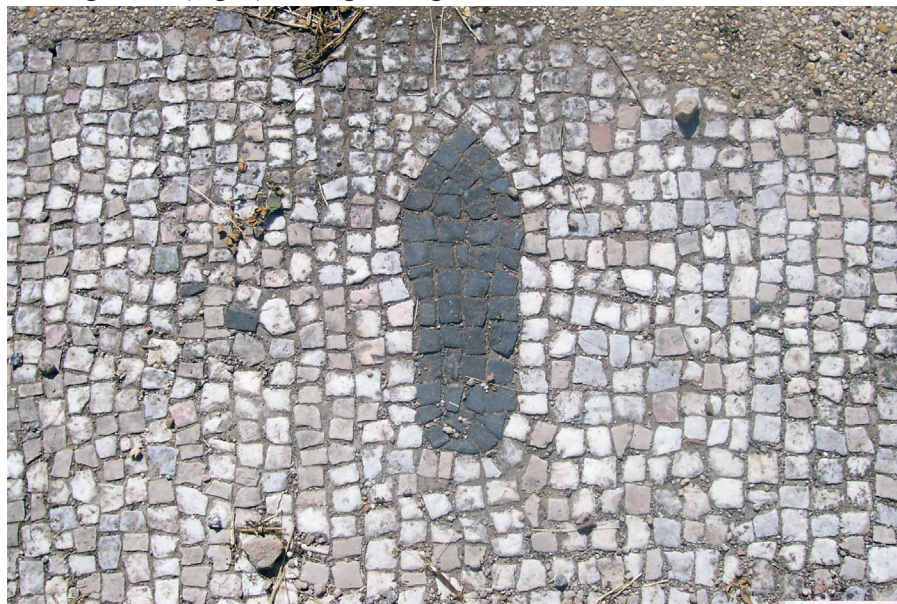
Mithraeum of the Planta Pedis.

Mithraeum of the Planta Pedis , AD 176-180 (Becatti 1954: 77-85; Becatti 1961: 142 n. 281; Floriani Squarciapino 1962: 47-48): the decoration of the mithraeum is almost a century later than its construction, being dated to the time of Valerian (AD 253-260). This is limited to the mosaic representation of an imprint of a shod right foot (Fig. 6). A religious significance was attributed to it: it could be