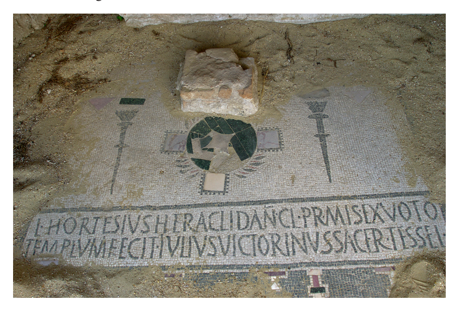
Figure 9 Horrea of Hortensius.

The so-called Sabazeum, early 3rd century AD (Becatti 1954: 113-117; Becatti 1961: 232 n. 431; Floriani Squarciapino 1962: 54-55): on the west part of the floor, between the podia, is a black-and-white mosaic (Fig. 10). We have a white tile inscription with black background (reversed from the other mosaics); only in one other case does a mosaic with the same characteristics appear, in the entrance of the Fire Station. Since an inscription with a dedication to Jupiter Sabazius was found in the filling soil, it was long thought that this could be a Sabazeum, but the side podia lead back to the Mithraic religion (Fructus / suis in / pendis / consum / mavit, CIL XIV 4297). The name of the dedicator, Fructus, also appears in the mosaic (in Ostia, there are 13 other attestations of the surname Fructus, mostly from college rolls). The krater, the snake, the sun and the moon also appear in the symbolism of the cult of Jupiter Sabazius.