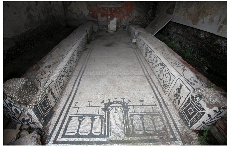
Mithraeum of the Seven Gates.

Mithraeum of the Seven Gates, AD 160-170, with mosaics from the beginning of the 3<sup>rd</sup> century (Becatti 1954: 93-99; Becatti 1961: 198-99 n. 378; Floriani Squarciapino 1962: 50-51): This was built inside a warehouse without modifying the original layout, with the exception of the back wall, where a brick niche was created (Fig. 3). While the walls were decorated with frescoes on plaster, the floor was decorated with mosaics.