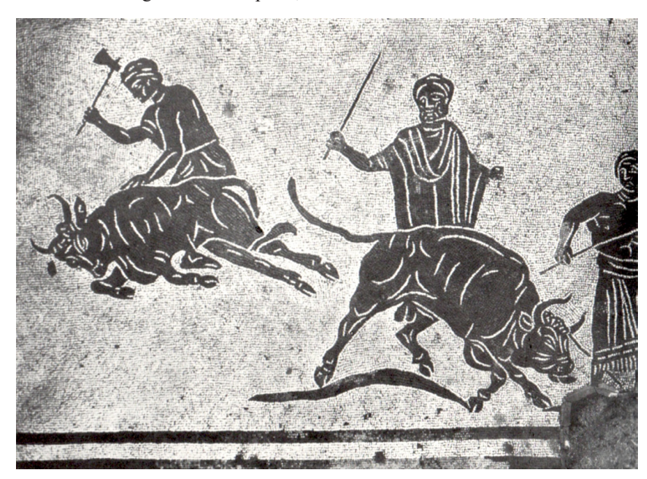
Figure 12 Barracks of the Vigili: Detail of the sacrifice scene (Becatti 1961: pl. 100).

Venus is the deity most present in the mosaic art of Ostia: if on the one hand she is linked to Mithras with the rank of Nymphus , the bridegroom, on the other hand she is loaded with symbolic meanings. According to the humanistic and philosophical tendencies of the time, it could be an allegory of serenity and wellbeing, which also reappears in sculptures placed in later buildings, such as those of Cupid and Psyche or Eros stringing a bow.