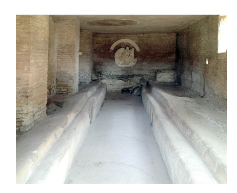
Figure 4 Mithraeum of the Seven Spheres.

At the front of the benches are the torchbearers Cautes and Cautopates , who were associated with Sol and Luna. Cautes raises a small torch. In his other hand is a cock, referring to the morning. Cautopates is lowering a large torch, the fire of which is indicated by red tesserae . It is peculiar that Cautes is on the "south" and dark side, Cautopates on the "north" and light side. This can be explained by linking them to another aspect of "north" and "south": the places where the souls of men entered and left the world.