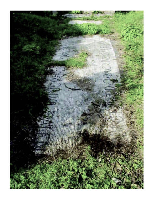
Figure 7 Mithraeum of the Imperial Palace.