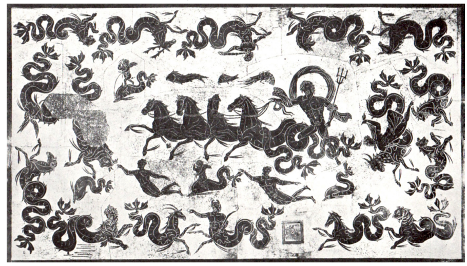
Figure 1 Neptune Baths: Neptune with Nereids (Becatti 1961: pl. 124).

The simple mosaics with geometric motifs of the late republican age were soon joined (from the middle of the 1st century AD) by figurative ones, often very complex. In most cases, the images had a communicative purpose by alluding to the function of the building or to the people who frequented it. For example, the numerous representations of Neptune and his large procession of Nereids, Tritons and sea monsters in the baths are well suited to covering the large spaces available with figures, but at the same time they are closely linked to the intended use of the baths themselves (Fig. 1).