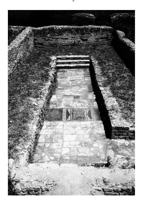
Figure 10 I.e. Sabazeum.

Recall the scene of Mars approaching the sleeping Rhea Silvia (Becatti 1961: 36-37 n. 59, pl. CV; Pellegrino 2017: 55), one of the happiest achievements of