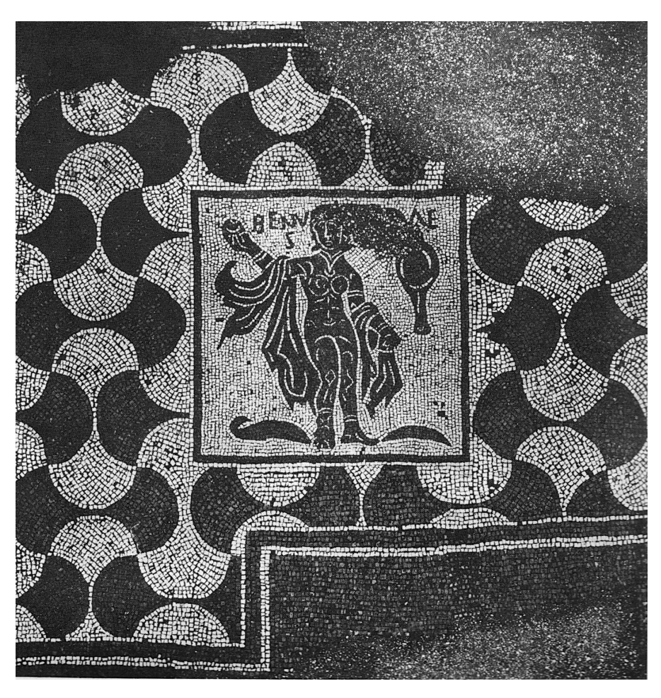
Figure 13 Venus in the mosaic of the House of the Thunderbolt (Becatti 1961: pl. 112).

Other divinities closely linked to the Urbs are the Dioscures, present since the time of the early Republican Rome. In the domus, which takes its name from them, they may have a reference to the activity of the owner of the villa (Fig. 14).